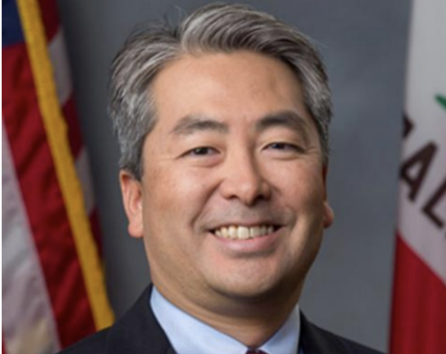
CALIFORNIA REALTORS® thank ASSEMBLYMEMBER MURATSUCHI for protecting condo buyers